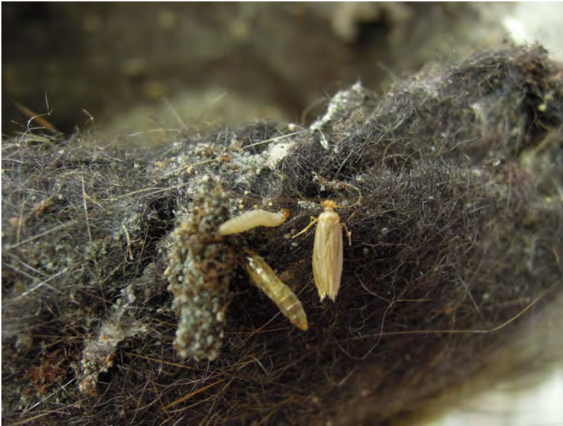
Webbing clothes moth damage to a wool hat

Several challenging factors that can arise when confronting clothes moth populations in an apartment complex.