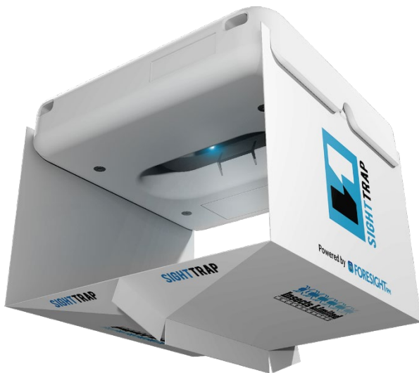
SightTrap Remote Pheromone Monitoring System

check our spaces without a physically presence. There are remote rodent monitoring devices that will show which specific traps have captured rodents, so you know exactly which areas have issues and which specific traps need to be addressed when you are able to access the property. Along those same lines, remote insect monitoring systems like the SightTrap™ take a daily picture of the trap and send an image to our smartphones or computers at home. Users have access to an automatic data-producing dashboard paired with each trap, so they know whether or not there is a pest concern in that area. This is the best scenario possible when we are not able to physically be at the location where the trap is located.