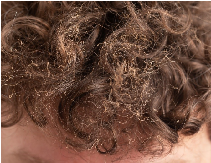
The strong sulfur odor that emits from burnt hair comes from the sulfur compounds in keratin

Just how difficult is keratin to ingest? Consider house cats and wild cats alike that constantly clean, lick and ingest their fur. Even in the highly acidic digestive tracts of these predatory animals, their ingested hair does not break down. Instead it accumulates into hair balls that need to be coughed up or even removed for the health of the cat. This shows that keratin is one tough compound!