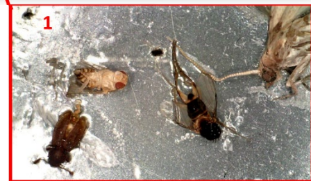
Pictured here from left to right: Foreign Grain Beetle, Red Eyed Fruit Fly, Phorid Fly, and Indian Meal moth