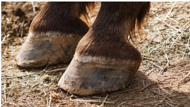
Hooves, horns, fingernails and the outer layer of skin also contain keratin

When an animal dies outdoors, after about one month, all that is left of the poor creature is a pile of hair, skin, and bones. The reason that these parts remain is the simple fact that Mother Nature has very few participants willing and able to consume these materials. The large amounts of keratin in the hair, feather, skin, nails, hooves, horn and the enamel on teeth make it extremely difficult to digest for nearly every species in our world.