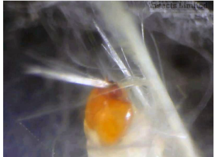
Clothes moths like this webbing clothes moth larva feeding on a feather are one of the few insects able to break down keratin

are beneficial and quite frankly, without this set of insects we would have large numbers of partially decomposed animal carcasses lying all around the place. Mankind's only real problem with these insects occurs when we want to preserve certain wools, furs, hides, hooves, antlers or other keratin-based material in our homes and museums. The same insects that help us in nature can be a curse in these locations as they feed on our woolen sweaters and rugs and destroy our precious goods.