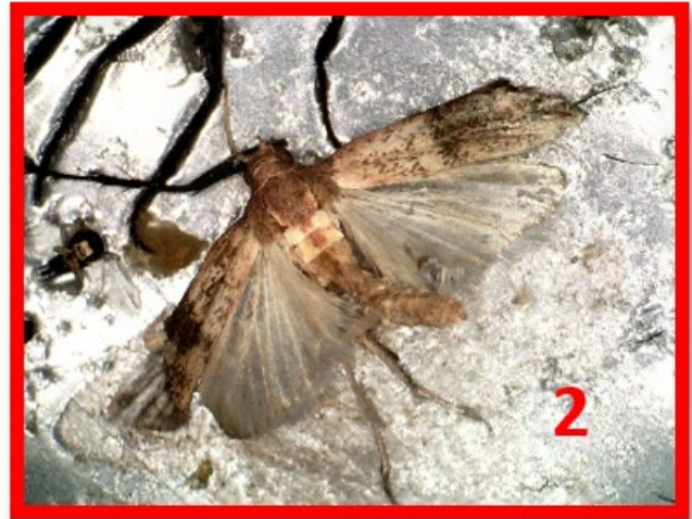
Male Indian Meal Moth