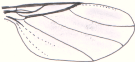
wing Pora sp. (Phoridae, Diptera)

Like the Fruit fly, Phorid flies have a wide range of food possibilities most commonly feeding on gunk (organic matter). With three distinguishing features, the Phorid fly is easily identifiable. One feature is a "humpback." This is the reason another common name for the Phorid fly is the Humpback fly. In my image, the "humpback" is hard to detect so I move on to the second distinguishable feature: the legs. Not getting too wrapped up in the anatomy of insects, the thigh of the Phorid fly is noticeably thicker than the rest of the leg. These insects have a strong ability to move and scuttle around quickly. Therefore, they have another common name, the Scuttle fly. The third identifying feature is their distinct wing venation as seen in Figure 1. I cannot give you an exact reason for the presence of the multiple Phorid flies on my GreenWay Window Fly Trap , but I assure you I will be looking as they are often an indication of a fractured pipe leaking water somewhere unseen.