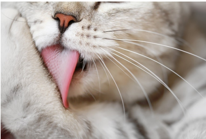
Hair does not break down in the highly acidic digestive tracts of cats

Just how difficult is keratin to ingest? Consider house cats and wild cats alike that constantly clean, lick and ingest their fur. Even in the highly acidic digestive tracts of these predatory animals, their ingested hair does not break down. Instead it accumulates into hair balls that need to be coughed up or even removed for the health of the cat. This shows that keratin is one tough compound!