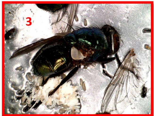
Female Green Bottle Fly releases eggs as she dies

I know this is an Indian meal moth because of its bi-colored wing. The outer half of the wing is covered with copper-colored scales while the top portion is tan. Fortunately, for the sake of our business, I will never escape them.