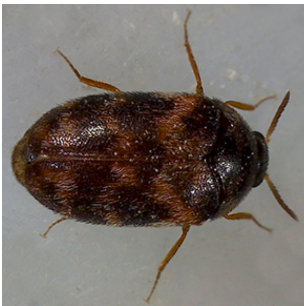
Photo: Warehouse Beetle

Case #2: “The case of a four-month old baby boy in California was similar to the Indiana case. Here the baby was fed a high-protein baby cereal in which the larvae of Trogoderma ornatum was later found. (One live, one dead, and two cast skins) were taken from the original package of the baby cereal. According to the mother, the baby became ill two or three days after eating the cereal. The baby did not vomit, but had mild diarrhea. The interviewed mother stated: ‘the baby showed signs of varying degrees of digestive distress, culminating in a severe outbreak of screaming and crying and absolute refusal to eat. Anytime it was offered food it became rigid and red, and arching his body and screaming, evidently in pain).’”